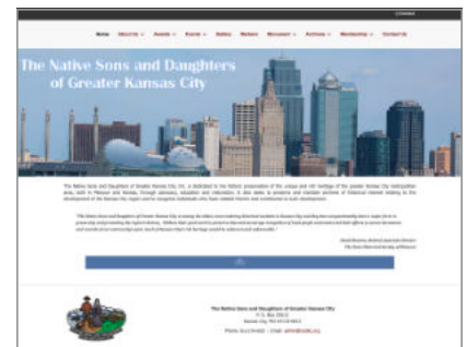
Current NSDKC.org Website

Our website was another Board priority. A new platform, format, and functionality are currently being designed. The new model, look and feel, will enable more graphics, improved mobile-device navigation, easier updating, etc. Our implementation target is March 2026.