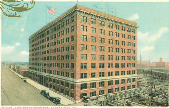
H-2134 LIVESTOCK EXCHANGE, KANSAS CITY, MO.