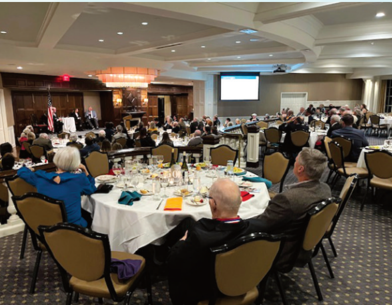
Approximately 100 attendees at 2024 GALA